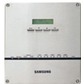
DMS 2.5 MIM-D01AUN

Additional control options available. Please refer to SamsungHVAC.com for all control options, features and specification.