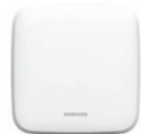
THERMOSTAT ADAPTER MIM-A60UN