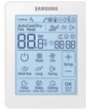
TOUCHSCREEN WIRED CONTROLLER MWR-SH11UN