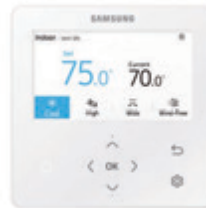
ADVANCED WIRED CONTROLLER MWR-WG00UN