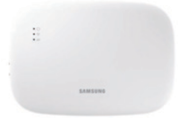
WI-FI ADAPTER MIM-H04UN